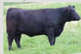
Maternal Sister to Dam: Ravenworth Ruby 25C Working at Wilbar Cattle Co, Dundurn SK

This is the kind of bull that will last in your herd, he is extremely sound in his movement and good footed. He has an explosive amount of muscle in his hip that carries down his leg. His dam, RAVE 4Y is a visually impressive cow with her immense capacity.