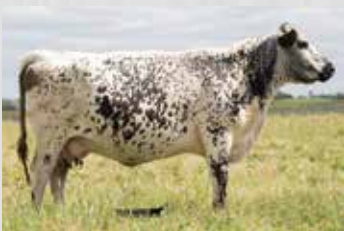
Dam: Ravenworth Prairie Lily 9Y

Here is a heifer bull thru and thru. This is the first ever bull calf produced by Ravenworth Prairie Lily 9Y, she likes to make heifers. So we are very excited to offer this bull as 9Y produces absolutely lovely females. Her udder is sound and balanced and she is long bodied with lots of volume. Accent 323H will produce quality females and smooth balanced bull calves.