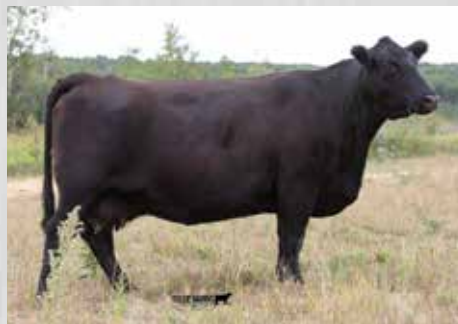
Dam: Ravenworth Ruby 12Z