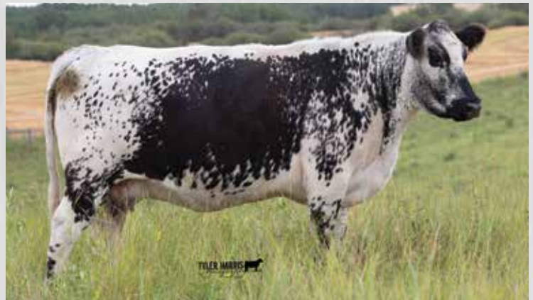
Dam of Embryos: Ravenworth Prairie Lily 132C

Qualified for Canada, USA, Australia and New Zealand. Stored at Bow Valley Genetics. Shipping and related costs to be assumed by buyer.