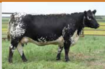
Dam: Beauty Melissa Of P.A.R. 561B

Damaris is a cow that is a definite standout in pedigree and performance. She is the oldest of the three sisters that we currently have in our herd and is from a proven mating. She has a speckled heifer calf sired by Wall Street at her side.