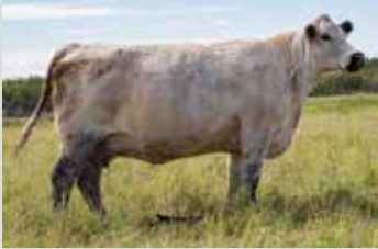
Dam: Ravenworth Lightning Lady 121D

Take note of this female if you like 'em deep. If you want to talk about a big bodied, visually impressive dam look no further than Ravenworth Lightning Lady 121D. This younger heifer shows a lot of performance and muscle dimension. A sound individual with fluid movement and a sharp front end, this heifer is the full package. With the unmistakable phenotype of an Invictus daughter.