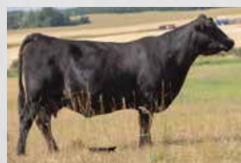
Dam: Ravenworth 68Z Elba 19C

A 3/4 brother to RAVE 17H, he carries several of the same features, balanced and smooth made, long bodied and deep. His maternal granddam is Ravenworth Elba 14Z an Elite/Premier dam.