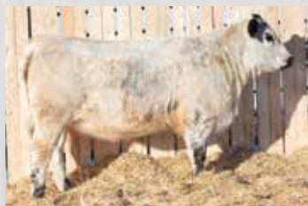
Full Sister to Lot 22: Colgan's Fizzah 13F