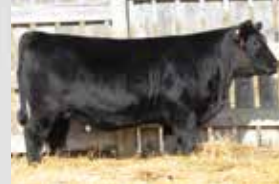
Maternal Sister: Ravenworth Lady Bate 11G Working at Double T Cattle Co., Glentworth, SK

Attractive, long and balanced, this bull is smooth made with great muscle shape and deep in the flank. His dam, RAVE 9B, is a consistent producing cow in our herd who is a stand out female with a tremendous udder.