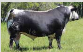
Sire: Ravenworth Invictus 103C