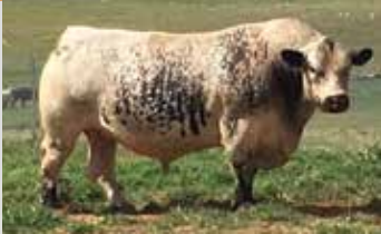
Sire of Embryos: Wattle Grove Smoke And Mirrors L275

We are offering CHOICE on this lot, take your pick of three embryos from Wattle Grove Smoke And Mirrors L275 or Colgan's General 20G. This is one of the only Speckle Park cows we have flushed here at Pick-It Livestock, so that right there tells you she has to be a good one - she goes back to the good Codiak Cougar 54R. These embryos are hard for us to sell, but planned these mating to be game changers to the breed. A moderate framed cow with lots of depth, middle, PLENTY of milk to bulls we think are going to change the breed as they are freaks of their own. Embryos are stored at Davis-Rairdan Embryo Transplants. Storage and delivery fees are the responsibility of the purchaser. QUALIFIED FOR NORTH AMERICAN ONLY.