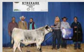
Full Brother: Ravenworth Midas 105G Grand Champion Bull Stockade 2018