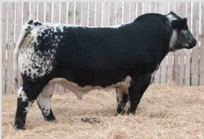
Sire of Embryos: Colgan's Frasier CF 11F