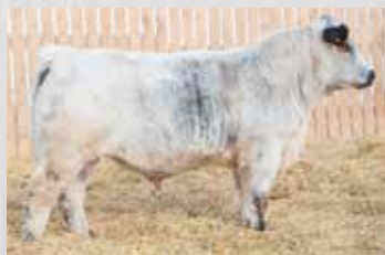
Maternal Brother to Lot 20A: Colgan's Galileo 24G