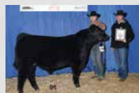
Full Brother: Ravenworth Renown 9F 2018 Grand Champion Bull at Sask Junior Angus Association Gold Show