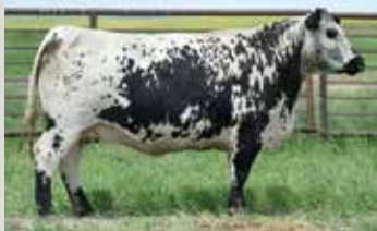
Dam: Colgan's Calaya 16C