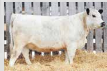
Maternal Sister to Lot 21A: Colgan's Cadence 06C