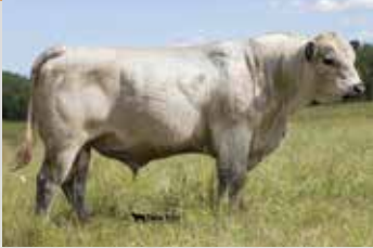
Sire: Wolf Lake Free Trade 42F

Same great cow...different sire. Ravenworth Acadia 113C bred to a new sire, Wolf Lake Free Trade 42F for her natural calf. This combination resulted in a very powerful bull calf with tons of style. With excellent performance and oozing eye appeal, this bull has lots to offer backed by the Acadia cow line which has produced many excellent bulls and females.