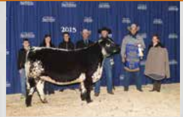
Dam of Embryos: Ravenworth Western Jewel 116B

We are offering two (2) lots of three (3) embryos from Ravenworth Western Jewel 116B and the following sires: Colgan's Baxter 1B and JSF Wall Street 36E. There is only one package available from each sire. The calves are eligible to be registered as PUREBRED. Embryos are stored at Davis-Rairdan Embryo Transplants. Storage and delivery fees are the responsibility of the purchaser. Qualified For Australia, Europe and North America.