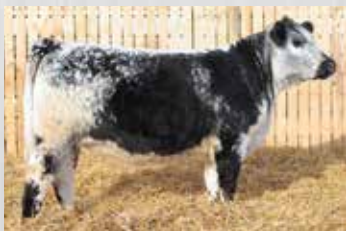
Dam: Colgan's Diamond 116D