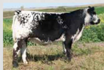
Full Sister: Colgan's Golden Jewel 05G Co-owned with Pick-It Livestock

The calves from this proven mating are like 'peas in a pod.' They all exhibit power and performance and CCCC 25H is no exception. Hercules is the quietest in the pen. Lot 31A are full sibling embryos.