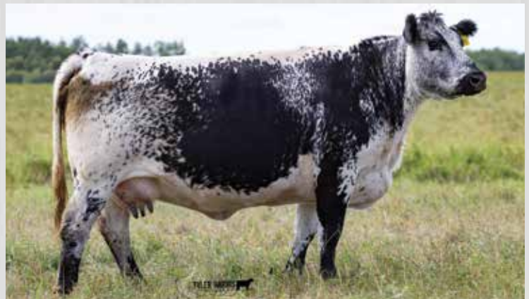
Dam of Embryos: Spots 'N Sprouts 31A