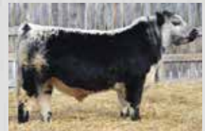
Full Brother: Ravenworth Obsession 101G

Each time we repeat this we are ecstatic. Ravenworth Acadia 107E, Ravenworth Adrenaline 115F, and Ravenworth Obsession 101G were all in our show strings. Based on this proven performance we selected this breeding combination for our flush program and once again are very pleased with the resulting calves. Here is a bull calf that would easily stand in with his full siblings from past years' breedings. As an embryo calf he comes with a little more birth weight,