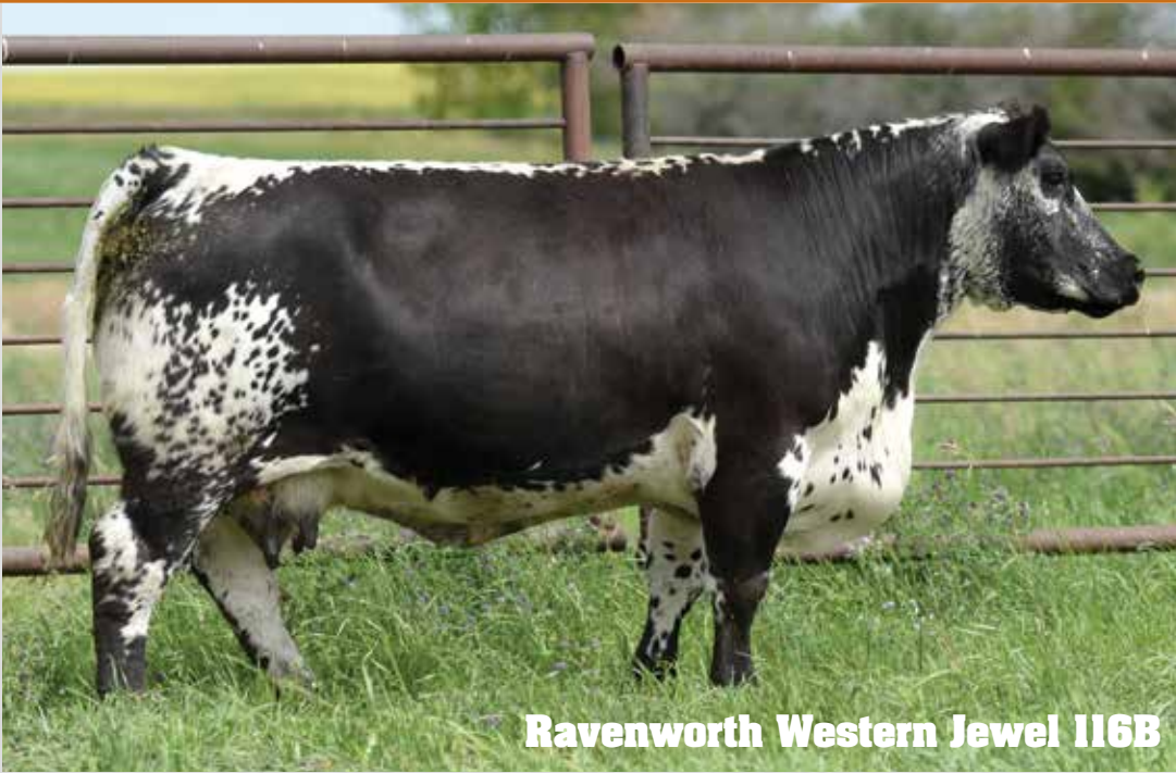
Ravenworth Western Jewel 116B