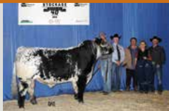
Son: Colgan's Dexter D'Angelo 01D

10Y was one of the first cows we had purchased to start our purebred Speckle Park herd. She is a powerhouse cow that has the ability to produce champions (Colgan's Dexter D'Angelo 01D). Janko 12J, sired by JSF Wall Street 36E, is a full sibling to Colgan's Hardwired 03H (Lot 13).