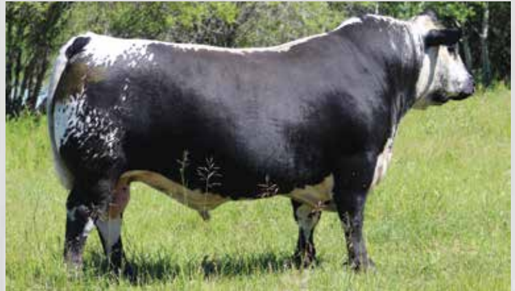
Sire of Embryos: Ravenworth Invictus 103C

Qualified for Canada, USA, Australia and New Zealand. Stored at Bow Valley Genetics. Shipping and related costs to be assumed by buyer.