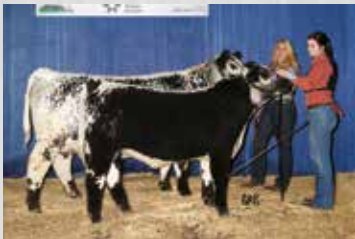
Dam: Ravenworth Lightning Lady 120C

Rich in heritage genetics from our herd, this heifer will be a powerhouse of production. Her dam is Ravenworth Lightning Lady 120C, who has many admirers in the show or in the pasture. Full sibling to this heifer, Ravenworth Stetson 112G and 120C were Reserve Champion Senior Female at Agribition 2019. With Stetson 112G being our high selling yearling bull at our bull sale spring 2020 for $12,500 to Watsons in Ontario. We have two full sib females producing in our herd and they are two of our favourites, with balanced outstanding udders.