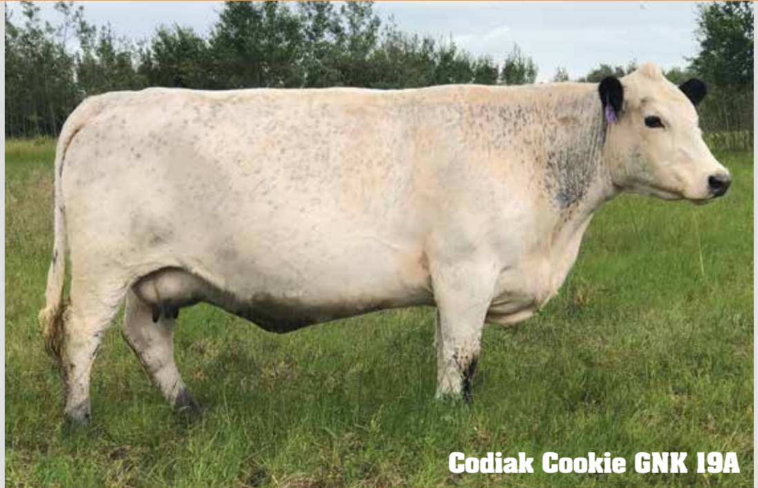
Codiak Cookie GNK 19A

We are offering CHOICE on this lot, take your pick of three embryos from Wattle Grove Smoke And Mirrors L275 or Colgan's General 20G. This is one of the only Speckle Park cows we have flushed here at Pick-It Livestock, so that right there tells you she has to be a good one - she goes back to the good Codiak Cougar 54R. These embryos are hard for us to sell, but planned these mating to be game changers to the breed. A moderate framed cow with lots of depth, middle, PLENTY of milk to bulls we think are going to change the breed as they are freaks of their own. Embryos are stored at Davis-Rairdan Embryo Transplants. Storage and delivery fees are the responsibility of the purchaser. QUALIFIED FOR NORTH AMERICAN ONLY.