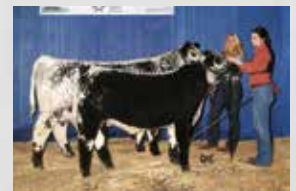
Ravenworth Lightning Lady 120C