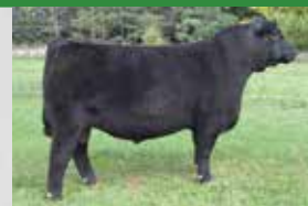
Sire: Musgrave Foundation