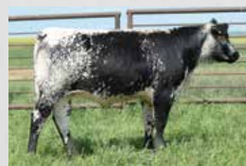
Maternal Sister to Lot 21A: Colgan's Farrah 06F