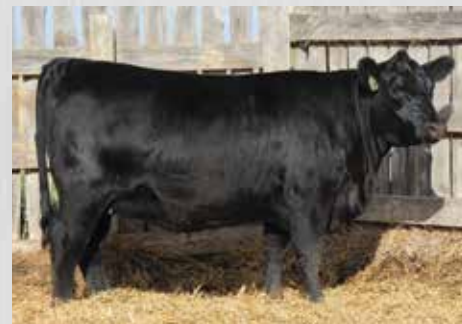
Maternal Sister: Ravenworth Ruby 24D Working at Everblack Angus, Vermillion, AB