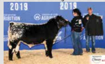
Colgan's General 20G

General is packed with power and performance and has a proven pedigree. He was the 2020 Stockade Roundup Reserve Junior Champion and the 2019 CWA President's Classic Speckle Park Champion. Semen is qualified for Canada, USA and Australia. We are only selling Canada and Australia qualified semen as the USA semen rights are owned by Prestwould Park.