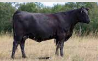
Dam: Ravenworth Elba 7F

This Motive 9016 son is the highest indexing weaning weight calf in our group of bulls. His granddam, Ravenworth Elba 14Z is an Elite/Premier Angus Dam. 2H has extra neck extension and a very smooth shoulder. This deep flanked bull has great hip shape and is really sweet in his lines. He has massive volume and big performance. Just an all around attractive bull. The dam is an ICC Pay Raise daughter, giving this bull a very unique pedigree.