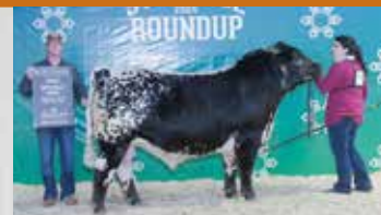
Colgan's General 20G