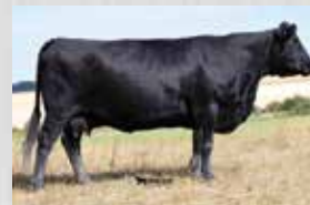
Dam: Ravenworth 68Z Lady Bate 9B