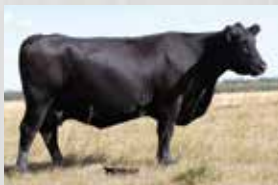
Dam: Royal S Pride Dolly 3B