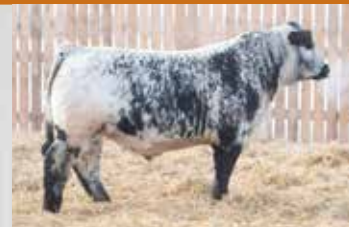
Son: Colgan's Galveston 11G

Moovin Zpotz Zen 37Z is another of our foundation females. She has produced offspring that have sold at the Summit 3 Sales and Ladies of the Fall Sales. We have kept two of her daughters in our herd. Her 2021 heifer calf is either sired by JSF WallStreet 36E or Pine Valley Robber 6F (a Zeppelin son and 8R grandson). Parentage and genetic testing will be completed on the calf prior to sale.