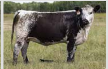
Full Sister: Ravenworth Lightning Lady 126F

For details on how to bid online, turn to page 48