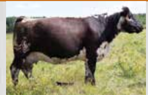
Dam: Ravenworth Acadia 113C