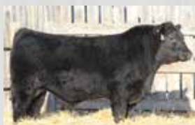
Paternal Brother: Ravenworth Logic 16E Working at GJG Angus, Swift Current, SK