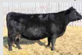
Maternal Sister to Dam: Ravenworth Ruby 11C Working at K-Cow Ranch, Elk Point, AB