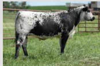
Maternal Sister: Colgan's Fatema 34F