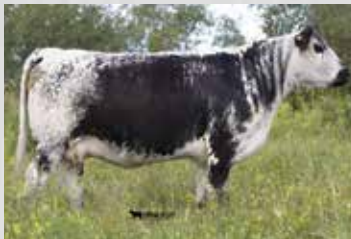
Full Sister: Ravenworth Lightning Lady 105E