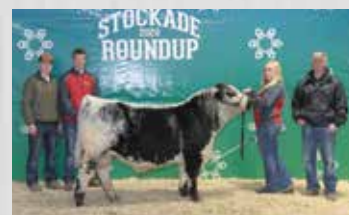
Greenwood Headliner 71H

Headliner was our 'pasture pick' of the Greenwood bulls this past summer. He was the 2020 Stockade Roundup Grand Champion Speckle Park Bull, King of the Ring Speckle Park Champion, and placed in the 'Top 4' in the Supreme. Semen is qualified for Canada, USA and Australia. 50% of semen rights retained by Greenwood Speckle Park.