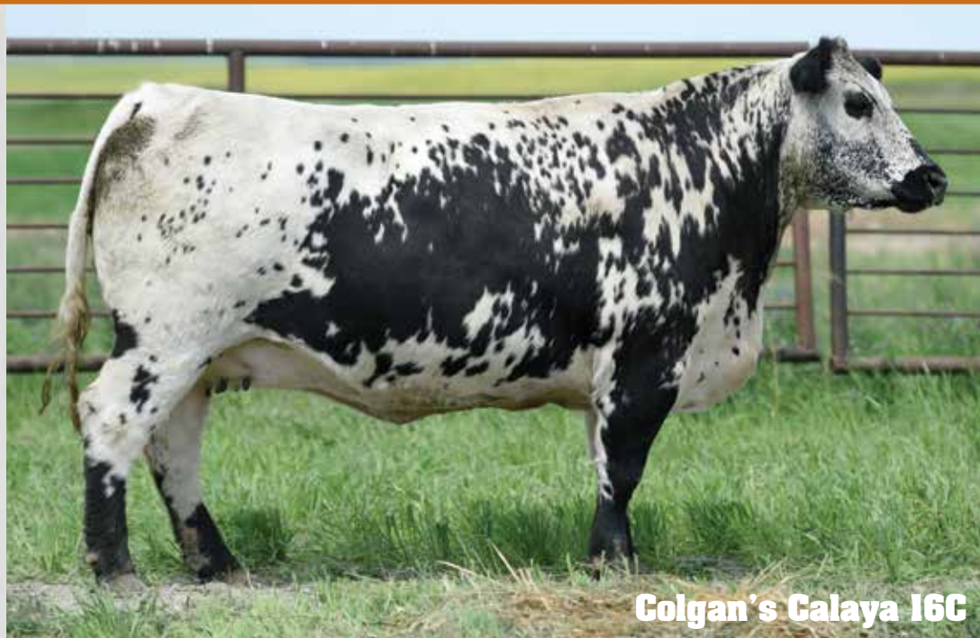
Colgan's Calaya 16C

We are offering two (2) lots of three (3) embryos from Colgan's Calaya 16C and the following sires: Colgan's Frasier CF 11F and Colgan's Dexter D'Angelo 01D. There is only one package available from each sire. The calves are eligible to be registered as PUREBRED. Embryos are stored at Davis-Rairdan Embryo Transplants. Storage and delivery fees are the responsibility of the purchaser. Qualified For Australia, Europe and North America.