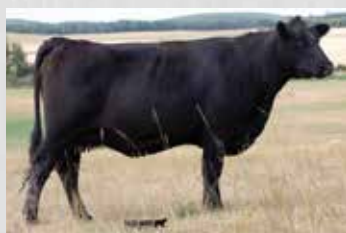
Dam: Ravenworth Ruby 14F

Paintrock Trapper and this International daughter made an impressive match. Producing a bull that is long with a big middle and great structure. This bull is extremely docile. His dam has a level udder with excellent teat size.