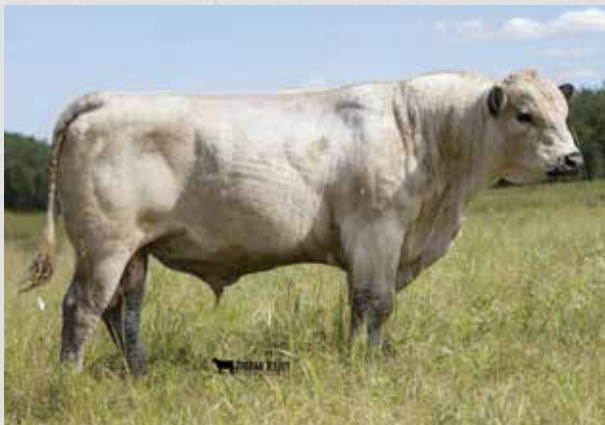
Sire: Wolf Lake Free Trade 42F

This heifer is forged from the same cow family as Invictus himself. With a dam that captivates an audience, females of this magnitude rarely come up for sale. 120E earns the honour of one of the best udders in our herd. The dam, Ravenworth Northern Star 120E with calf 129G at side was Reserve Senior Champion Female at the 2019 Stockade Round Up. We have added 129G to our herd, so this has opened the door for someone to have access to this amazing cow family.