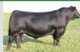
Sire: S A V Renown 3439

If you're looking for a bull with an outstanding phenotype, look no further. This bull is an eye catcher with his sheer substance and muscle dimension. He is sound made with longevity built in from his stacked pedigree going back to Vermilion Dateline. His dam has an amazing udder for a first calver. Highest Yearling weight index at 122.