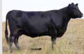
Dam: Ravenworth 68Z Ruby 26C

This Innovation bull, off our walking herd sire, has depth and muscle shape passed down. RAVE 26C is a Motive daughter with a great udder. Well balanced and tons of muscle shape and a great phenotype. Here is a bull that will add some performance to his calves. Innovations are known for great feet.