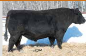
Sire: Pick-it Eazy-E 1E