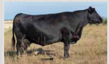
Maternal Granddam: Ravenworth Elba 14Z