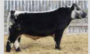
Son: Ravenworth Stetson 112G

Ravenworth Lightning Lady 120C has been in our show string many times from a bred heifer to multiple times with calf at side. Ultra feminine, huge topped, explosive spring of rib and great feet this female does a fantastic job in our herd. With her son being our high selling bull last year and one of her daughters in this sale (Lot 52), you can see what she can do and it is substantial. We have milking daughters in our herd and they are two of our favourites. Here is a chance to flush this cow the way you like.