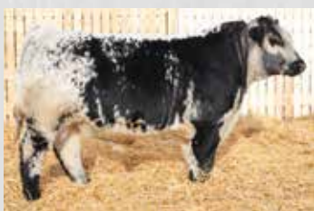
Sire: Colgan's Dexter D'Angelo 01D