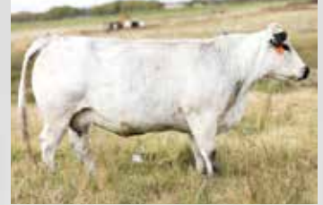
Dam: Spots 'N Sprouts 10Y

Hardwired 03H has been a standout from birth. Rest assured his slightly higher birth weight than his full brother (Lot 20A) is a result of him being an ET calf.