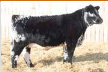
Full Sister: Colgan's Gamma Ray 19G