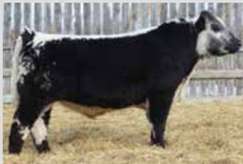
Full Brother: Ravenworth Stetson 112G