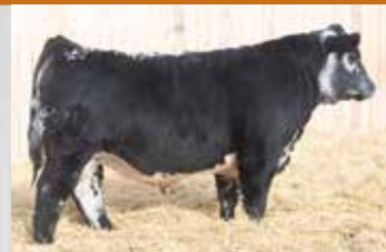
Maternal Brother: Colgan's Gallagher 41G