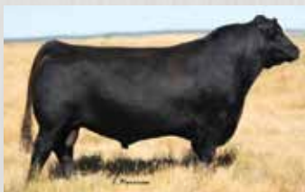
Sire: Soo Line Motive 9016