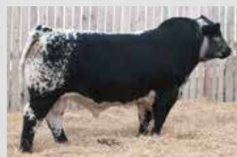
Sire: Colgan's Frasier CF 11F