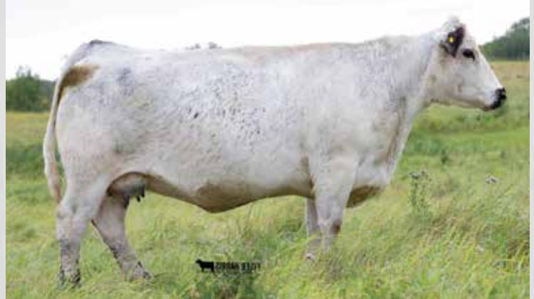
Dam of Embryos: Ravenworth Acadia 115A

Qualified for Canada, USA, Australia and New Zealand. Stored at Bow Valley Genetics. Shipping and related costs to be assumed by buyer.