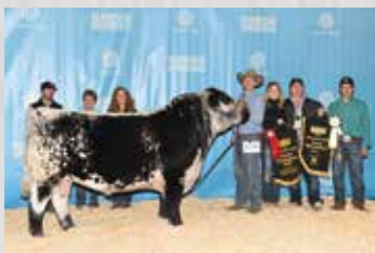
Sire: CAJA Zeppelin 1B

CCCC 14H is an ET calf that is one of the "top picks" in the bull pen.