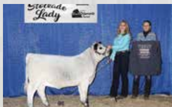
Full Sister: Ravenworth Prairie Lily 109F Stockade Lady Breed Champion 2018

306H has the "it" factor! When searching out your next young herd sire, the traits and characteristics that come to the top of your list are quickly evident; performance, muscle shape, phenotype, feet and legs and a smooth front end. Checking off this list easily, 306H earned his name. This calving ease bull will add dimension, muscle shape and eye appeal to his progeny. This bull carries a lot of presence. Terms: Selling full possession and 50% semen interest.