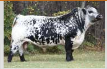
Sire of Lots 13-18, 20A, 21A, 22A, 25, 28 & 31B: JSF Wall Street 36E