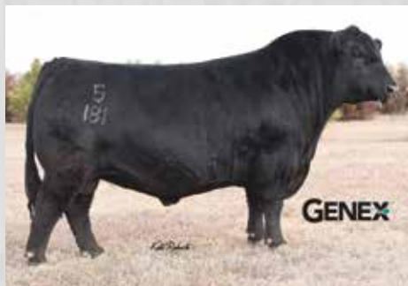
Sire: Paintrock Trapper

Looking for style? RAVE 13H brings the look, with an attractive head and clean front end. With muscle shape, a long body and balance this bull checks all the boxes. His dam, RAVE 12Z is a cow with huge volume and a gorgeous udder.