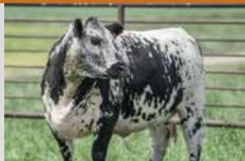
Dam of Embryos: Colgan's Calaya 16C

We are offering two (2) lots of three (3) embryos from Colgan's Calaya 16C and the following sires: Colgan's Frasier CF 11F and Colgan's Dexter D'Angelo 01D. There is only one package available from each sire. The calves are eligible to be registered as PUREBRED. Embryos are stored at Davis-Rairdan Embryo Transplants. Storage and delivery fees are the responsibility of the purchaser. Qualified For Australia, Europe and North America.