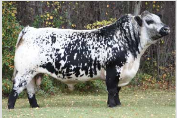
Sire of Embryos: JSF Wall Street 36E