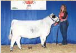
Full Sister: Ravenworth Clover 101E Stockade Round Up