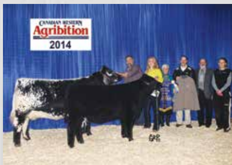
Dam: Notta 26T Janette 3W Grand Champion Agribition

You can always pick out an Invictus daughter from a mile away for her ideal amount of muscle with the unique addition of a long and attractive front end. These females work, we have many milking Invictus daughters in our herd doing an outstanding job from first calvers on. Her dam, Notta 26T Janette 3W is an explosive middled cow with depth right through the flank and hip.