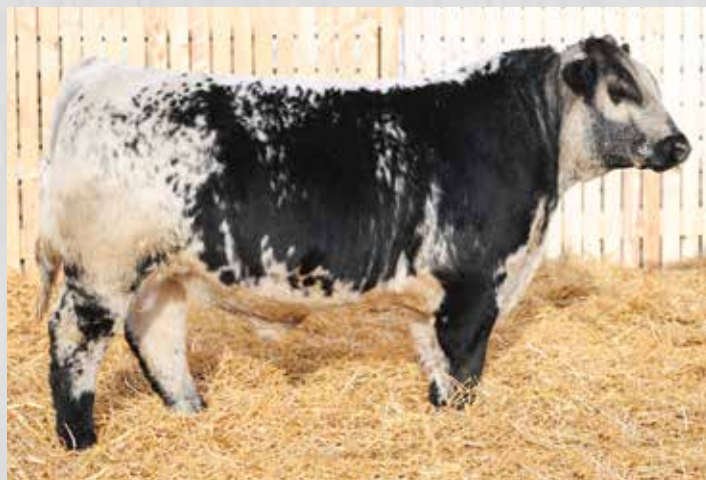
Sire of Embryos: Colgan's Dexter D'Angelo 01D