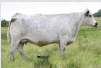
Dam: Ravenworth Acadia 115A

Ravenworth Acadia 115A is a matriarch cow in our herd, that has produced fantastic females and here is an exceptional son. With very stringent selection on flush cows from our herd, this cow easily made the program with her track record and here is a flush son. The mating to Invictus is a bang on match. Many of the females from this cow line have been part of our show string with champions sprinkled throughout.