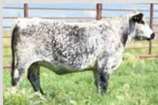
Maternal Sister: Colgan's Eleta 41E