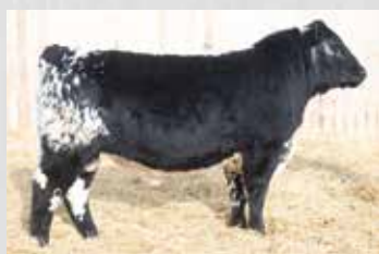
Full Brother to Lot 22: Colgan's Guardian 43G