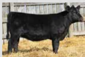
Paternal Sister: Ravenworth Lady Bate 20G Sold to Wade Olynyk, Crescent Creek Angus, Goodeve, SK

This boldly sprung, wide topped heifer has show stopping style and eye appeal. Our walking bull, CCCJ Lotto 21E has sired some very attractive calves and this is definitely one of them. Maternal Grand sire is Royal S Yellowstone 29D, adding a little something extra.