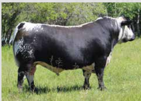
Sire: Ravenworth Invictus 103C