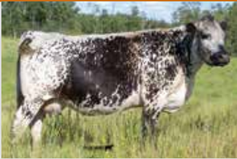
Dam: Six Star Lightning Lady 22W

From a very young age this bull was super masculine in his style and structure. His dam always raises exceptional bull calves with the absolute best heads. She is also the dam or granddam to the popular Lightning Lady show cattle and high selling females we have had over the years. This 12-year-old cow is still working in our herd with a track record of not only high selling bulls and females, but also champions and many from her cow line are working in our herd. This bull is the kind who will stamp his look on his progeny.