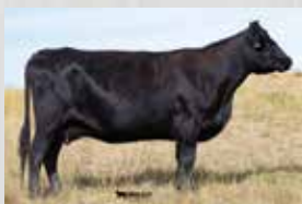
Dam: Linwood Ruby 5U

With a maternally packed pedigree, 19H is destined to become a highly productive female. Longevity, fertility and udder quality are top traits in this cow line. Her dam is still producing at 13 years of age, and had a previous daughter selected for the Power & Perfection Sale at Agribition. Females from this cow line always stand out in the pen or in the pasture. Maternal siblings working at Paetsch Livestock, Jansen, SK, Ranch Jacques Therriault, Quebec and Seven-Hills Ranch, Neilburg, SK.