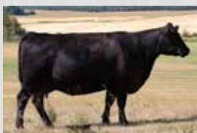
Granddam: Ravenworth 20Z Elba 33B