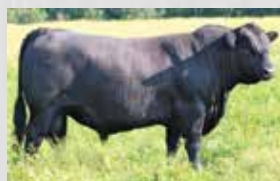
Sire: Ravenworth Innovation 33E