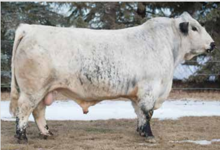
Sire of Embryos: Colgan's Baxter 1B