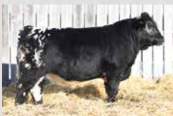
Full Brother: Colgan's Esteban 27E