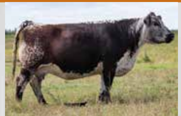
Dam: Ravenworth Prairie Lily 122B

Muscle shape, thickness and overall width is what Influencer 303H is all about. With Ravenworth Prairie Lily 122B as his dam, he is set to be a good one. Ravenworth Iconic 115E, working at Red Maple Speckle Park in Ontario and Ravenworth Prairie Lily 104G, Reserve Champion Female at the 2019 Stockade Round Up as a heifer calf as siblings from this dam, she has proven what she can do. Big, big middled, extremely wide topped and well sprung; this female puts a lot into her progeny. Sired by Ravenworth Rubicon 103F he is sure to pass on his muscle shape and thickness.