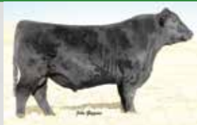
Sire: Sitz Logic Y46