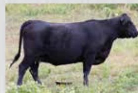
Dam: Ravenworth Ruby 6F