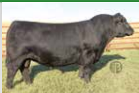
Sire: S A V International 2020