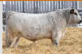
Maternal Brother: Colgan's Everett 03E