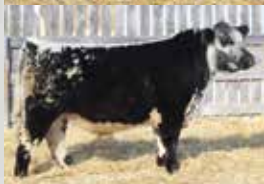
Sire: Ravenworth Rubicon 103F

This heifer is sired by Ravenworth Rubicon 103F, he was Reserve Senior Bull Calf Champion and Reserve King of the Ring Breed Champion in 2018. With superior performance and growth backed by generations of maternal sires we expect she will be producing in your herd for a long time.