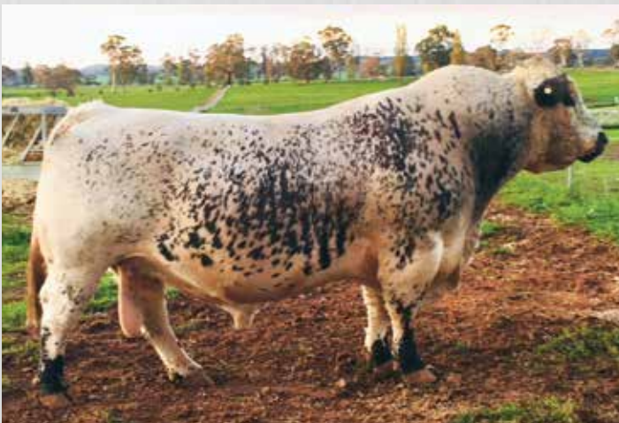
Sire of Embryos: Wattle Grove Smoke And Mirrors L275