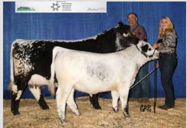
Dam: Ravenworth Northern Star 120E Reserve Senior Champion Female 2019 Stockade Round Up