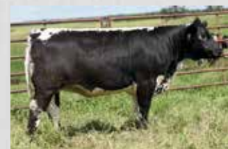
Dam: Codiak Promise Land GNK 17F