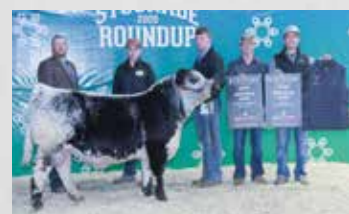
Greenwood Headliner 71H