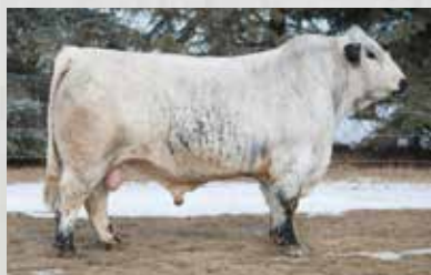
Sire: Colgan's Baxter 1B

Heathecoate's dam, Colgan's Chiffon 11C, was purchased by Fleetwood Speckle Park in the 2016 Summit 3 Sale and we purchased her back in 2019, as she has always been one of our favorites and we were confident in the offspring she would produce... and she did not disappoint!