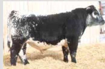
Maternal Brother: Colgan's Gentleman 09G