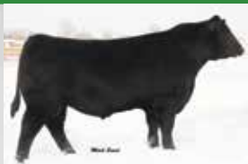
Sire: TC Aberdeen 759