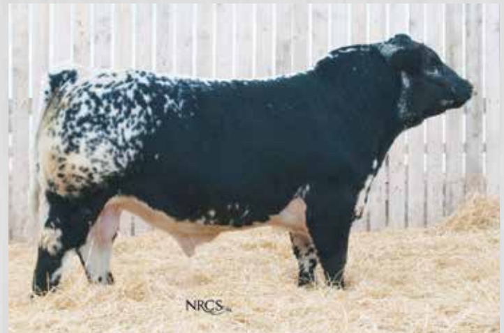
Sire of Embryos: Colgan's General 20G