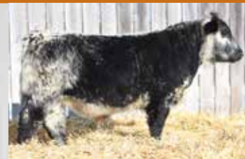
Son: Colgan's Elwood 26E

Pasture exposed to Pine Valley Robber 6F from May 10 to August 12, 2020. Confirmed 40 days pregnant on August 13, 2020.