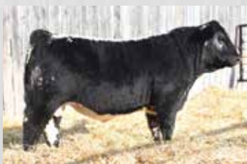
Full Brother: Colgan's Fullproof 27F