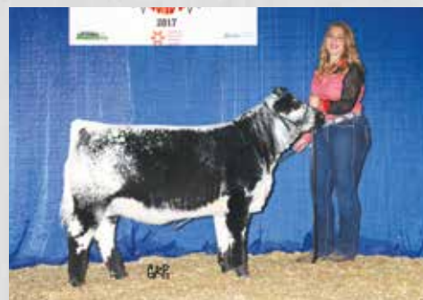
Full Sister: Ravenworth Willow 134E Junior Champion Heifer 2017 Stockade Round Up