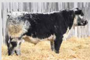
Maternal Brother to Lot 20A: Colgan's El Chapo 02E