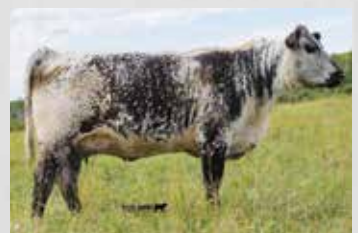
Dam: Ravenworth Northern Star 120F

Here is a bull with tons of masculinity, deep bodied, smooth made and a great birth weight. His dam is a Spots N' Sprouts Choreboy daughter who puts a lot into her calves. Energy 304H offers muscle dimension and some stretch.